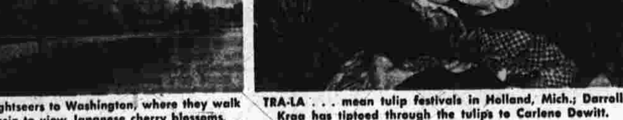
TRA-LA... draw sightseers to Washington, where they walk along the tidal basin to view Japanese cherry blossoms.